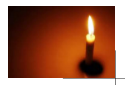
Healing is more likely to occur, if the mind can gently embrace any information that appears beyond positive and negative